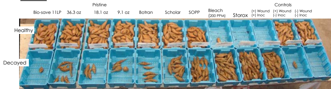
Demonstration at 2004 NC Field Day showing decayed roots (bottom row) and healthy roots (top row) for each treatment.